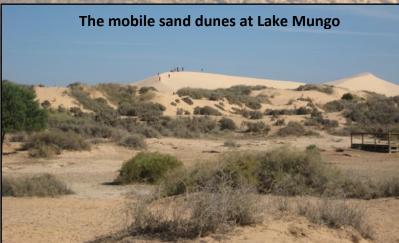
The mobile sand dunes at Lake Mungo