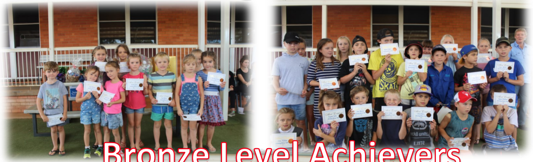
Bronze Level Achievers